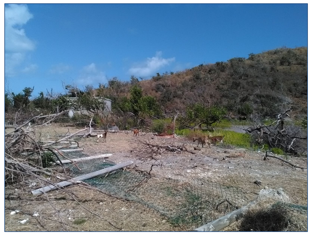
Figure 2: Feral goats observed at Prickly Pear National Park, February 2018

This represents three of the four islands that are being addressed by NPTVI in the DPLUS043 project. The fourth and smallest island of Green Cay (15 acres) has not been started, but it is not expected to take a long time as the island is small and easily accessible. The culling efforts were focused on the more distant and hard to access sites in Year 2 and all activities were delayed by the impact of the 2017 hurricane season.