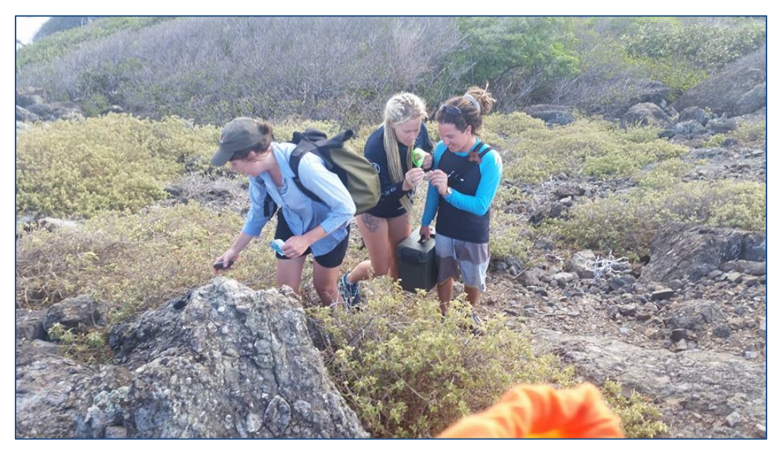
Figure 3: Volunteers assisting the JVDPS field team to set out the baiting grid at Green Cay

During the summer of 2017, the JVDPS field team made one visit per month to Seal Dog Islands totaling (4) visits were made to monitor for the presence or absence of rats. There were no images of rats recorded during any of the summer visits