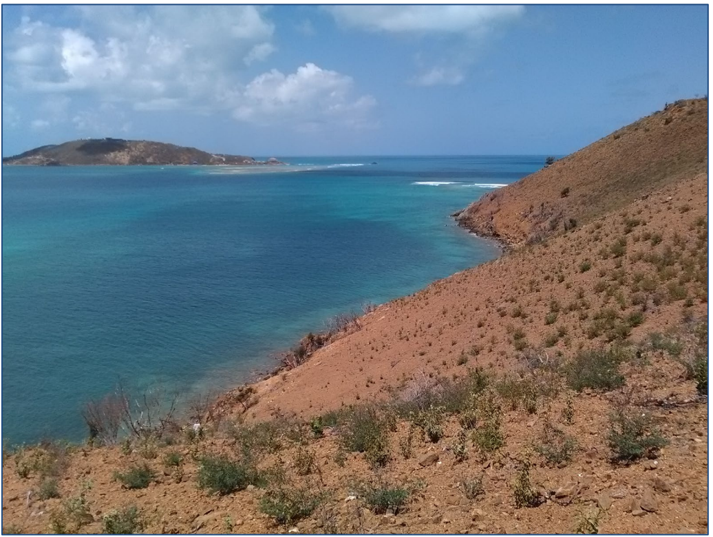
Figure 4: The landscape of Prickly Pear National Park was dramatically altered by the passage of two category 5 hurricanes in September 2017

When NPTVI and JVDPS staff are able to access Great Tobago National Park in June 2018 a bird count will take place at the frigatebird colony in order to compare to previous years. This will provide an insight into the extent to which the colony was impacted by the hurricanes of 2017.